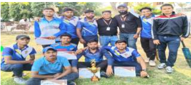
Congratulations!!! Cricket Team SGI for performing brilliantly in the tennis ball cricket tournament at Truba College and became the Runner- up by winning consecutive matches.