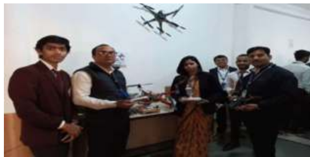
Students of 3rd semester Ex Department presented their projects in MSME program.

SIRTS PHARMACY B.Pharm III yr students successfully visited MOREPEN industry at Baddi, Himachal Pradesh during their 8 days industrial cum educational tour, where they learned about the formulation of empty hard gelatin capsule shells from the natural source. Around +70 students visited the industry. Students visited Manali, Shimla and Amritsar also and had fun and practical learning during their tour.